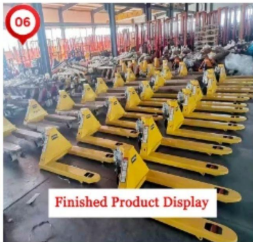
Finished Product Display