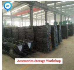
Accessories Storage Workshop