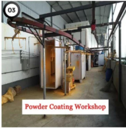
Powder Coating Workshop